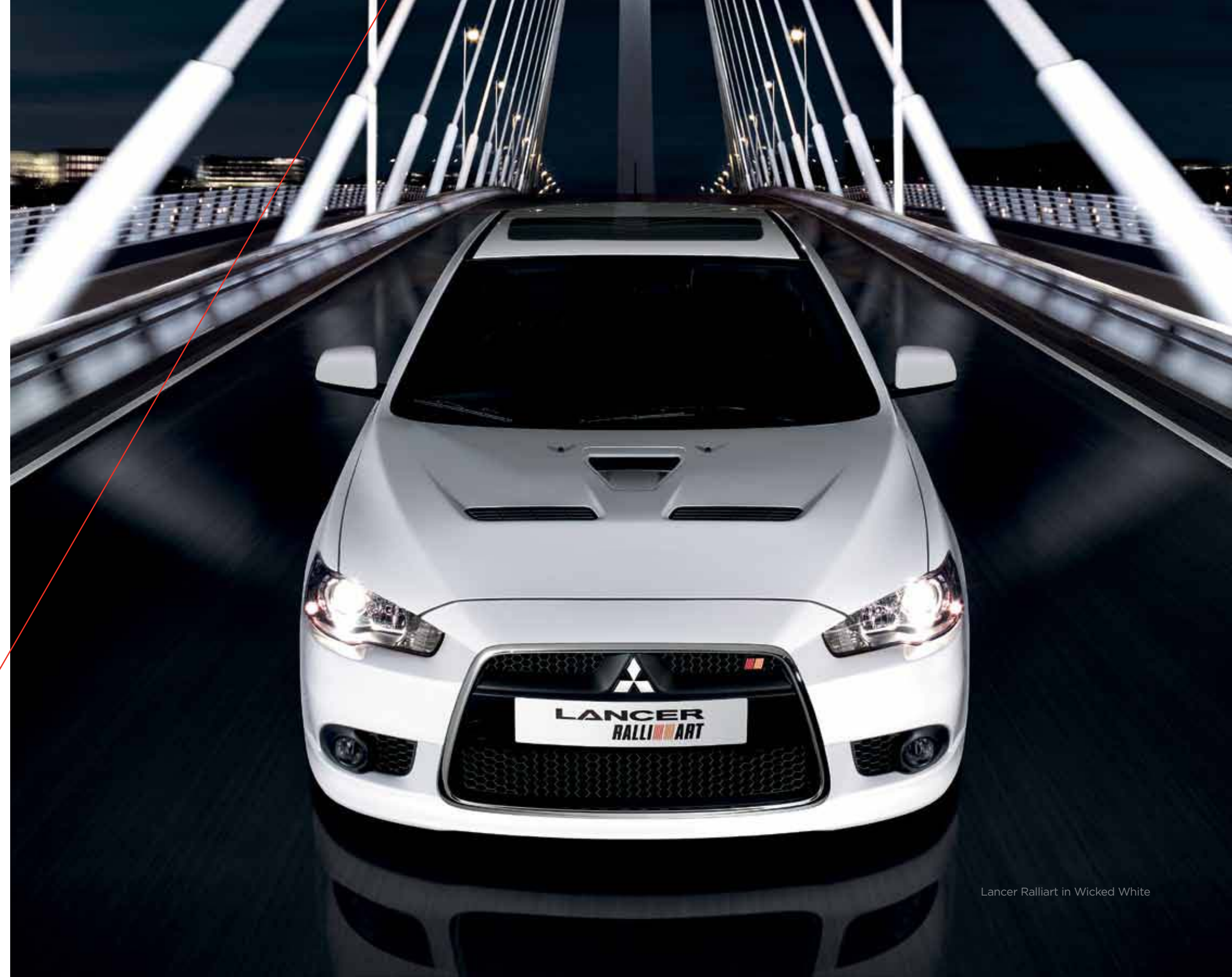
Lancer Ralliart in Wicked White

Taking action on traction. Combining an electronically-controlled 4WD system with our Active Stability and Traction Control system, All-Wheel Control regulates drive torque from front-to-rear with a network of dynamic handling technologies. The result: Enhanced driving performance and traction under a variety of road conditions.